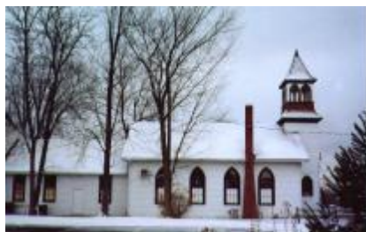
(Old Linworth UMC currently the Village Bookstore.)