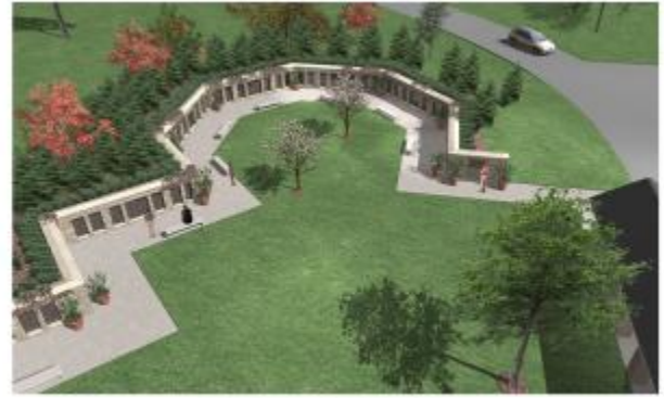
CONCEPT RENDERING - MEMORIAL GARDEN LINWORTH UNITED METHODIST CHURCH