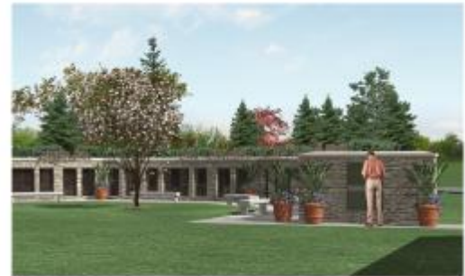
CONCEPT RENDERING - MEMORIAL GARDEN LINWORTH UNITED METHODIST CHURCH